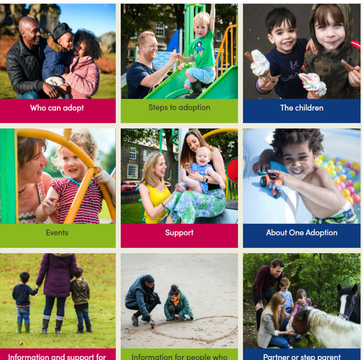
Information and support for first parents and relatives